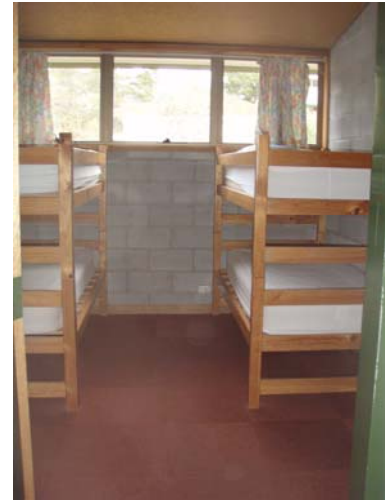
Photo: Dormitory accommodation

The accommodation comprises two large rooms with 25 bunk beds in each room and four smaller rooms (measuring 3m x 3.7m). These rooms are accessed via 800mm clear width doors and comprise bunk beds. However management is planning to replace these with zippable King singles (can be converted into King doubles). There is an accessible toilet at the end of a corridor. Past the dormitories, is a self-catering kitchen and dining room.