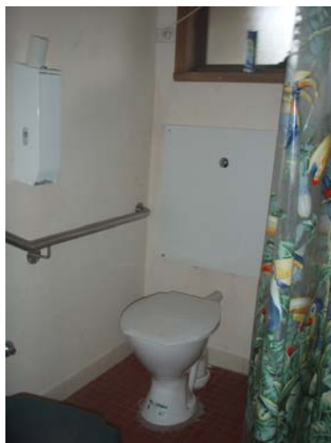
Photo: Dormitory accessible bathroom

The door offers clear space of 790mm, with a lever handle height: 1000mm into the open plan bathroom. There is a wheel-in shower with hand held rose, grab rails height 840mm and lever taps, 1250mm. Fold down shower seat dimensions - 500mm height; 270mm depth; 360mm length. The toilet height is 480mm, centre to side wall 450mm, front of bowl to rear wall 740cm, the grab rail height 830mm. Basin height offers 790mm clearance at the front with a lever tap. No mirror.