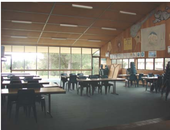
Photo: Dining area and kitchen

The dining hall offers self catered meals or catering for groups over 20. The kitchen is not designed to be wheelchair accessible. The dining hall is accessed via double doors with automatic closers, clear width 830mm one door open with handles height of 730mm. Table heights are 730mm with knee space of 670mm.