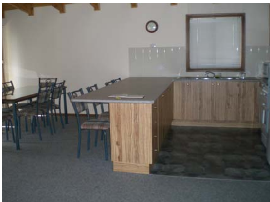
Photo: Kanangra Lodge living room & kitchen