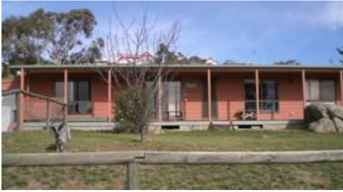
Photo of Reception with steps to verandah