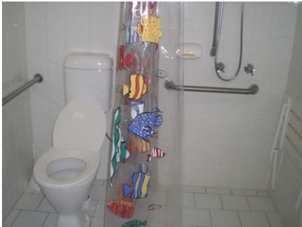
Photo: Bathroom interior

The bathroom door clear width is 820mm, with lever handle 1m high and opens inwards. There is a wheel-in shower with hand held rose, grab rails height 850mm and star capstan taps 920mm. Fold down shower seat dimensions - 480mm height; 360mm depth; 900mm length. The toilet height is 470mm, centre to side wall 470mm, front of bowl to rear wall 860mm, the grab rail height 860mm. Basin height offers 800mm clearance at the front with a lever tap. Light switches are at about 900mm.