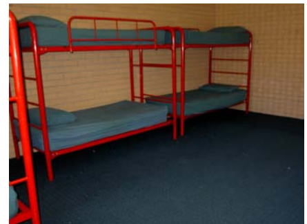
Photo: Room interior

A clear accessible path from entry to the building to room accommodation is via a corridor. The corridor is 1620mm wide. The clear door width to the room is 980mm with a lever handle at 1070mm. The door is fitted with an automatic closer, but its operation is light. The room contains bunk beds arranged around the room perimeter. A bathroom is located off the bedroom. Light switches are 1m from the floor and the emergency alarm is both audio (siren) and visual (strobe light).