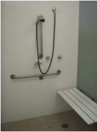
Photo : Bathroom interior