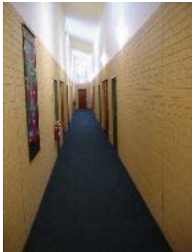
Photo: Hallway to accommodation

A clear accessible path from entry to the building to room accommodation is via a corridor. The corridor is 1620mm wide. The clear door width to the room is 980mm with a lever handle at 1070mm. The door is fitted with an automatic closer, but its operation is light. The room contains bunk beds arranged around the room perimeter. A bathroom is located off the bedroom. Light switches are 1m from the floor and the emergency alarm is both audio (siren) and visual (strobe light).