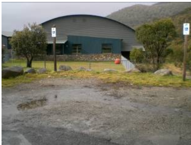
Approach and Entry: