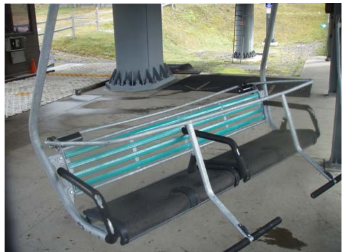
Kosciuszko Express Chairlift

The Snowgum chairlift is used 8 weeks either side of the ski season because of maintenance on the Kosciuszko chair. The Snowgum chair is accessible by a ramp that is 1230 mm wide, handrail 900mm high and a gradient of 7%. It is a two seated chair and has a much rougher walk at the top of the chair. It is a stair walk to Eagles nest café from the top of the chair. It is