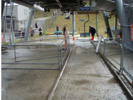
Snow Gum Chairlift

recommended that people who may experience problems with access plan their walk when the Kosciuszko Express chairlift is operational. Please call Thredbo Resort for shut down times. Staff who work at the Thredbo chairlifts are experienced with assisting people with disabilities.