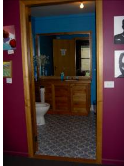
High Life Café Bathroom