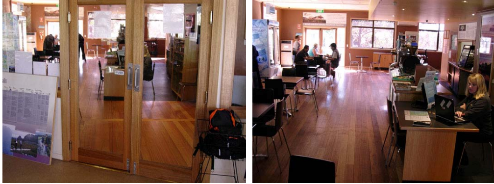
Picture 5 & 6: Double door leading to café, accessible bathroom and information counter

The café has an outdoor dining area. To enter to the outdoor area exit through double doors situated at the opposite end of the café to the park shop entrance. The doors have an opening of 800mm and 810mm and have hook lever handles at 950mm. Both doors have door closures and are heavy to medium weight. There is a lip below the door of 20mm. To the right of the exit to the outside area is an Internet café terminal and a public telephone at 1500mm high.