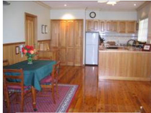
Picture 4. Kitchen/Dining

The sink tap is 485mm back from the front of the bench and 100mm higher than the bench.