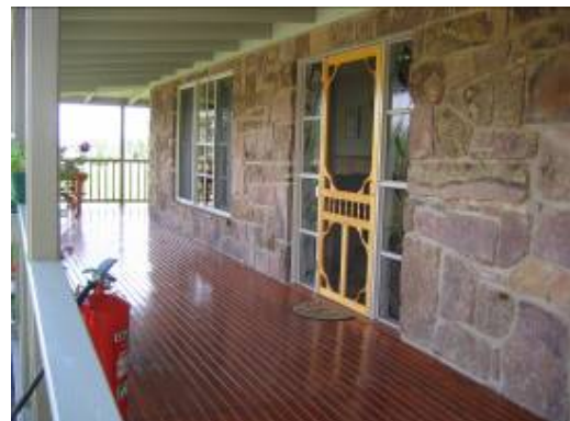
Picture 3. Entrance

The carport at the cottage is concrete, although a little narrow at 3m wide. There are plans to widen this area. At present vehicle exit on one side is onto a slightly uneven gravel surface while the other exits onto concrete adjacent to the ramp.