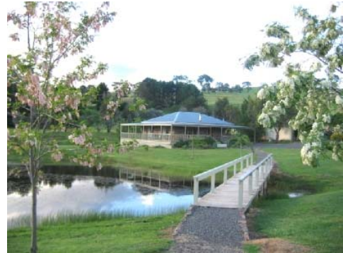
Picture 1. Buttercup Cottage

Buttercup Cottage is a self contained unit that sleeps 4, with 1 double and 2 single beds, located in a rural setting. The unit is quite spacious with good clearances and circulation space. Accessibility has been well provided for throughout the building with the bathroom, shower and toilet facilities in particular provide very good accessibility.