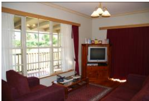
Picture 5. Lounge Area