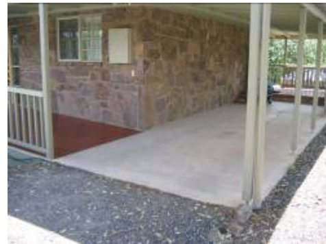
Picture 2. Parking

Parking is available at either reception or next to the cottage, however reception is not accessible. Reception is at the owners' house. There is a gravel parking area with a path (including two platform steps) to the front door of reception.