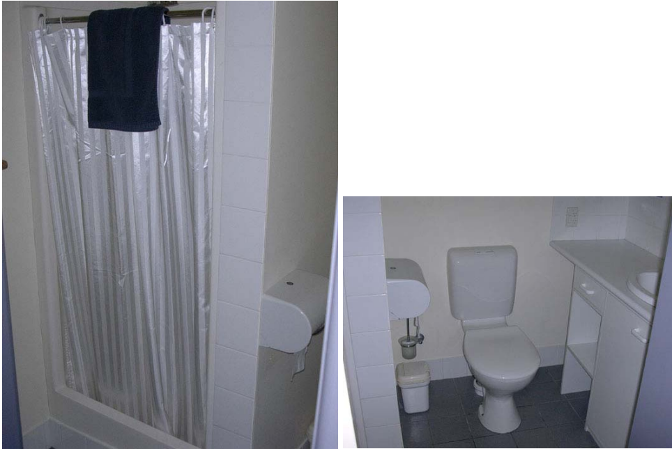
Figure 2. Bathroom Floor Plan

high and centreline to nearest object is 420mm. There are no grab rails. See diagram for floor plan.