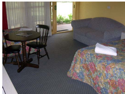
Picture 4. Bedroom/Living area and second entry

The living area consists of one double bed, one single bed, one two seater couch and one small table. The tea/coffee making and hanging space are in a separate room that leads to the bathroom and would be difficult to access due to limited circulation space and no under bench clearance. There is adequate circulation space in the living area and furniture could be easily moved to provide more space. Most switches are within clear reach other than those behind the double bed. There is a television and the remote control for this and the air conditioner is housed in a box at 1450mm high. There is a mirror at 810mm – 1760mm. The main bed is 600mm high and there is clearance underneath of 130mm. The bed could be raised on blocks if necessary.