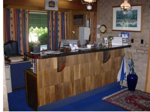
Picture 3. Reception counter

The reception area contains adequate circulation space. It also leads to the bar and restaurant. The reception counter is 1300mm and has some knee clearance of 300mm. There is good lighting and signage. A potential hazard is that the main entry to the reception and restaurant has also a potentially high traffic flow for guests checking in. This may impact on circulation space and safety.