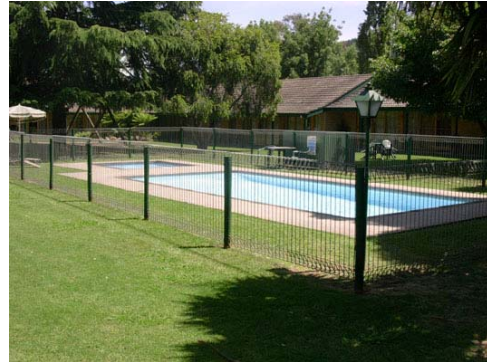
Picture 7. Swimming pool

A documented emergency procedure is displayed on the door of each room. The alarm is audio and a Warden will seek to evacuate guests to safe refuge. Each building has a number of emergency entry/exit points.