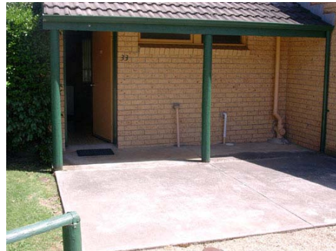
Picture 4. Parking and entry to motel unit

From parking space, disembark onto concrete and make way to the room entry on the left hand side of the park. There is a short threshold ramp 210mm long of 18.5% gradient through a 770mm doorway, with inward opening door, door knob with lock at 970mm height. The entrance hall narrows down to 710mm leading to bedroom ahead and tea/coffee facilities and bathroom to the right. The floor is tiled in the bathroom and entry hall and low pile carpet elsewhere. No emergency exit signs are shown but there is a second entry/exit at the opposite end of the bedroom/lounge area. The second entry is a sliding door of medium weight. The door handle is at approximately 1100mm and the clearance is 900mm. There is a threshold of 40mm internally and 70mm externally.