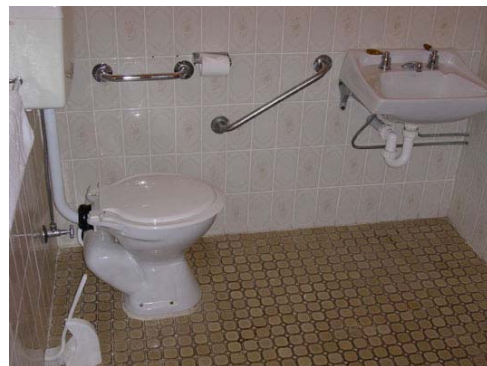
Picture 5 & 6. Shower and toilet layout