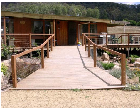
Picture 2. Reception entry

Reception can be found up the hill at the owner's home. It is best reached by car/coach, and is clearly signed. At the house there is no designated accessible parking bays, however there is plenty of spaces to park. Parking is over loose gravel on a firm base and there is a clear path of travel to the reception. Distance to reception is approximately 10m and includes a ramp with a 12% gradient. The ramp is made of timber slats. It is 2050mm wide and approximately 6m long. A 20mm step needs to be negotiated to get onto the ramp. The door into reception is light, inward opening, and is 760mm wide. The handle is a knob, 900mm high. There is plenty of circulation space once in the reception area, over floorboards. Lighting is good and a doormat is the only potential hazard. There is no counter to negotiate.