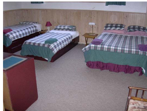
Picture 7. Open plan bedroom

There are two open plan bedroom areas. The one with the best circulation space comes off the lounge area. There are 3 beds in this area, one double and two single. Next to the double bed is adequate space for a transfer. The height of this bed is 520mm, and the bed can be raised with blocks if available. The current clearance is 130mm. NB neither single bed has under clearance. It is possible to move furniture to enable hoist transfers. There is a freestanding wardrobe with a hanging height of 1500mm. There is no mirror. Floor surface is low pile carpet.