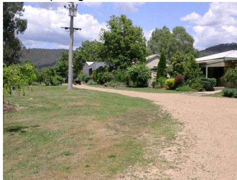
Picture 1. Entry

Aspens Springs provides farm stay accommodation. An array of farm activities is offered, including feeding of farm animals, pony rides, and fishing. There are also facilities for special interest groups such as artists, photographers, gardeners, paragliders, horse riders, bushwalkers and birdwatchers. The owners are very willing to help anyone with access needs. There are 3 cottages in total, with one being set up with adequate accessibility - Peacock Barn. Peacock Barn can sleep up to ten people. Another cottage has an accessible bathroom, which can be accessed through a carport. All cottages are fully self-contained.