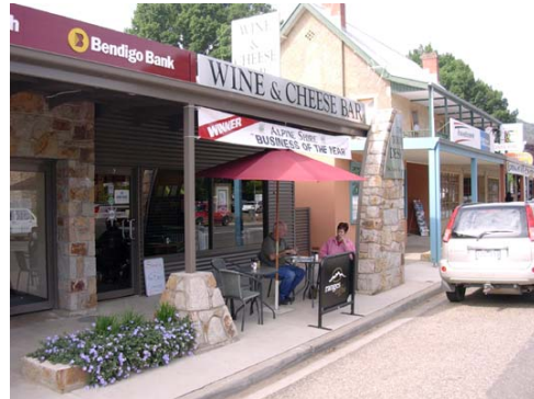
Picture 3. Parking

There is no designated parking. General parking is available on the street parallel to the shop front however there are a number of street planter boxes that impinge on potential circulation space. The path of travel could be directly onto the foot path (avoiding the planter boxes), or via the road ahead to the first intersection where there is a drop gutter that leads up onto the concrete footpath. There are tactile pavers at this drop gutter.