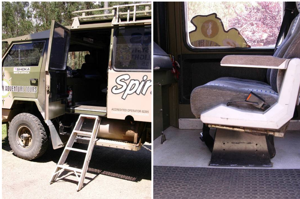
Picture 1 & 2. Tour vehicle and seating

5 Star Adventure Tours also operates a café/wine and cheese bar at their shop front in the town of Bright. This café also offers an accessible toilet.