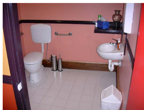
Picture 7. Bathroom

Also in the bathroom is a concertina screen. This may impact on circulation space.