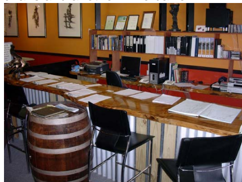
Picture 5. The Tour Desk

Passing through the door, the path of travel remains at 830mm wide until past a large wine barrel on the left. Here at the front of the shop is The Tour Desk which is the reception for 5 Star Adventure Tours. The counter is 950mm high, with underside clearance of 900mm and knee depth clearance of 200mm. There are several chairs and another wine barrel positioned along this counter that would need to be moved to allow space for a wheelchair. There is adequate circulation space between these chairs and the barrel at the entrance. Lighting for the shop front comes from street lighting and appears adequate. Signage for the café is effective with several signs and a sandwich board. Signage for 5 Star Adventure Tours is comparatively small and does not stand out.