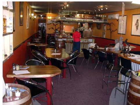
Picture 6. Wine bar and cafe

The wine bar is licensed and there are menus at the table. The café offers light meals from breakfast through to the evening. They do not have a large print menu available.