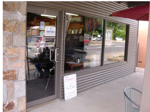
Picture 4. Front entrance to shop/café

From the road turn left back along the footpath (with a cross fall gradient of 3.5%) back to the shop front. At the entry there is a slight gradient of 5.5% for approximately 500mm immediately in front of the entrance door. The door is inward opening of medium weight with a self door closure. The door width is 830mm clear with the door handle (hook) at 950 – 1250mm in height. There is a door mat inside the door providing a minor potential hazard. Otherwise the flooring is low pile carpet.