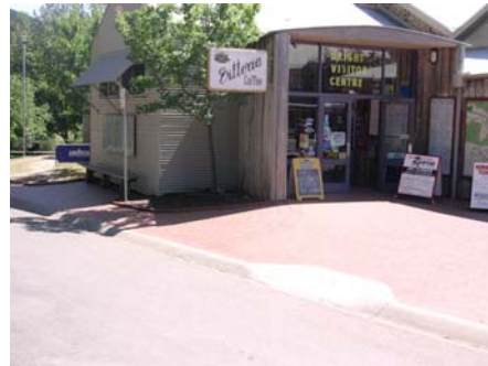
Picture 1. Entry to café via visitors centre

There are no designated accessible parking spaces, however there is a 10min drop off zone on the adjacent road (5m from Bright Visitor's Centre entrance), and an unsealed car park across the road with plenty of spaces. The coach set down area is in the same area. There is adequate circulation space to unload wheelchairs. The path of travel to the entrance is clear and accessible from the 10min zone. There is a drop gutter with a 9% gradient, The path is paved and free of hazards. The path slopes upwards 6.9% to the front door for 4.5m. There are no steps. From the car park, a road needs to be negotiated.