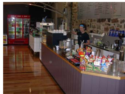
Picture 2. Café service area

There are double doors at the entrance of the Visitor's Centre, with one door being chocked open during summer. The door width is 790mm (with one door open). It has a D handle (820mm-1040mm high) and is outward opening. It is of medium weight. There is a foyer (approximately 1580mm wide, 3m long) before negotiating the same door set up again. Once in the Visitor's Centre the path of travel is straight ahead, past the information desk to your right and approximately 7m through to the Café entrance. Doors are left permanently open during opening hours and are approximately 800mm wide. The service counter is on the right hand side and is 900mm high, with no knee space. Signage is clear and lighting is good.