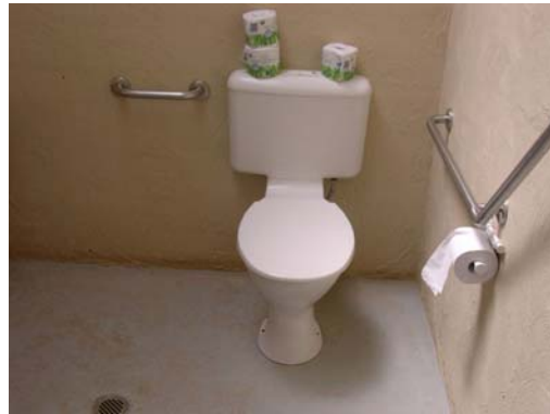
Picture 6. Accessible toilet