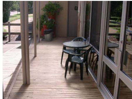
Picture 5. Path of travel to accessible toilet

There is an accessible toilet adjacent to the outdoor deck area. The key is with the Cafe Staff. The door to the outside area is 800mm wide, is inward opening, and self closes. It has a D handle, 800mm-1030mm in height. It is of medium weight. The path of travel to the toilet is to turn right once outside and travel along the deck for approximately 5 metres with minimum clearance past furniture 800mm. The decking opens up in front of toilet entries offering adequate circulation space. The accessible toilet is on the right and is unisex.