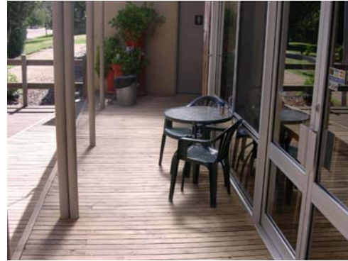
Picture 3. Path of travel to accessible toilet

There is an accessible toilet adjacent to Riverdeck Cafe. The key is with the Cafe staff. The door to the outside area is 800mm wide, is inward opening, and self closes. It had a D handle, 800mm-1030mm in height. It is of medium weight. The path to the toilet is along the deck, which is 1830mm wide. The bathroom is unisex. The door into the bathroom is 780mm wide. It is outward opening, of medium weight, and does not self-close. The outside handle is a D handle, approximately 1000mm high. There is good circulation space in the bathroom area, and the floor surface is concrete.