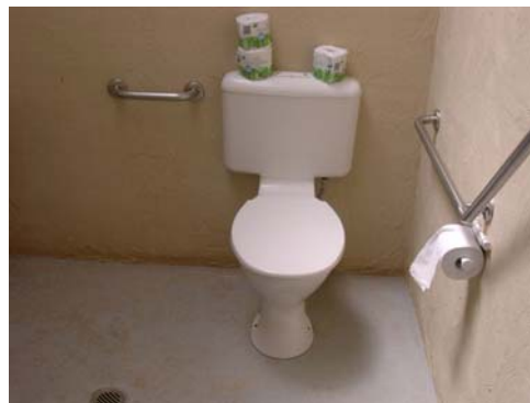
Picture 4. Accessible toilet