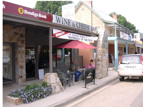
Picture 3. Parking

There is no designated parking. General parking is available on the street parallel to the shop front however there are a number of street planter boxes that impinge on potential circulation space. The path of travel could be directly onto the foot path (avoiding the planter boxes), or via the road ahead to the first intersection where there is a drop gutter that leads up onto the concrete footpath. There are tactile pavers at this drop gutter.