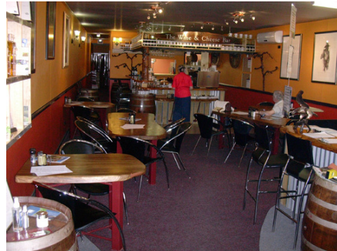
Picture 6. Wine bar and cafe

The wine bar is licensed and there are menus at the table. The café offers light meals from breakfast through to the evening. They do not have a large print menu available.