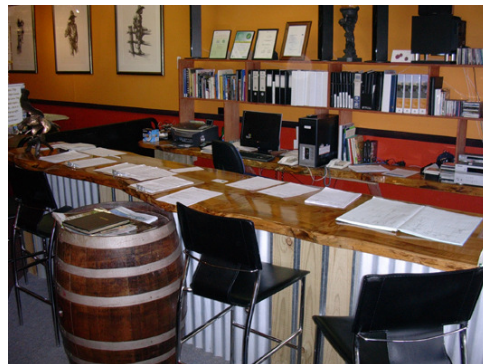
Picture 5. The Tour Desk

Passing through the door, the path of travel remains at 830mm wide until past a large wine barrel on the left. Here at the front of the shop is The Tour Desk which is the reception for 5 Star Adventure Tours. The counter is 950mm high, with underside clearance of 900mm and knee depth clearance of 200mm. There are several chairs and another wine barrel positioned along this counter that would need to be moved to allow space for a wheelchair. There is adequate circulation space between these chairs and the barrel at the entrance. Lighting for the shop front comes from street lighting and appears adequate. Signage for the café is effective with several signs and a sandwich board. Signage for 5 Star Adventure Tours is comparatively small and does not stand out.