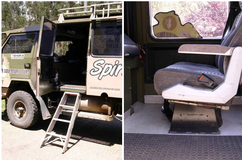
Picture 1 & 2. Tour vehicle and seating

5 Star Adventure Tours also operates a café/wine and cheese bar at their shop front in the town of Bright. This café also offers an accessible toilet.