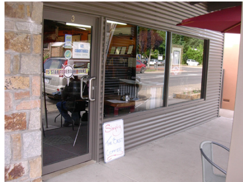
Picture 4. Front entrance to shop/café

From the road turn left back along the footpath (with a cross fall gradient of 3.5%) back to the shop front. At the entry there is a slight gradient of 5.5% for approximately 500mm immediately in front of the entrance door. The door is inward opening of medium weight with a self door closure. The door width is 830mm clear with the door handle (hook) at 950 – 1250mm in height. There is a door mat inside the door providing a minor potential hazard. Otherwise the flooring is low pile carpet.