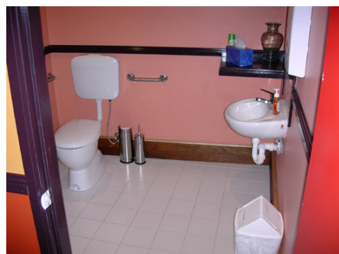
Picture 7. Bathroom

Also in the bathroom is a concertina screen. This may impact on circulation space.