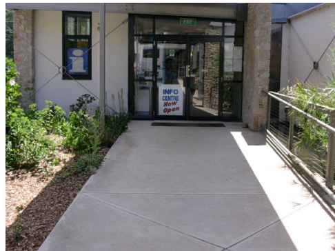
Picture 2. South east entry

Parking to the north east of the building the path of travel is across the gravel car park to a concrete ramp and brick wall. The concrete ramp continues for 4800mm at a gradient of 8% and then becomes wooden slats for a further 6000mm at a gradient of 7.3%. This wooden section also has a handrail. Right hand side ascending is 930mm high. Left hand side ascending is 850mm. The ramp width is a minimum of 2100mm. There is a large landing