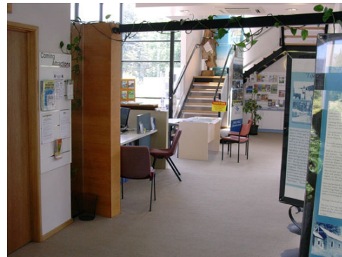
Picture 4 & 5. Information Counters