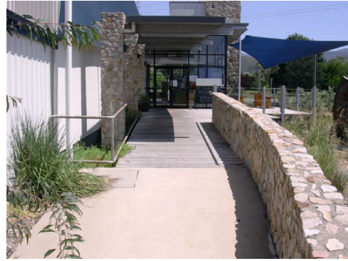
Picture 3. North east entry

area directly in front of the door way with ample circulation space. There are double doors with a single opening of 770mm clear. The door is outward opening, the hook D handle is 830 – 1060mm high and it has a self door closure.