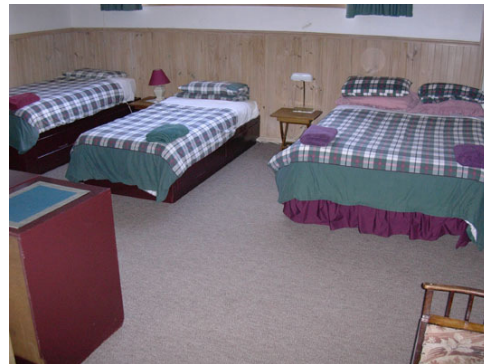
Picture 7. Open plan bedroom

There are two open plan bedroom areas. The one with the best circulation space comes off the lounge area. There are 3 beds in this area, one double and two single. Next to the double bed is adequate space for a transfer. The height of this bed is 520mm, and the bed can be raised with blocks if available. The current clearance is 130mm. NB neither single bed has under clearance. It is possible to move furniture to enable hoist transfers. There is a freestanding wardrobe with a hanging height of 1500mm. There is no mirror. Floor surface is low pile carpet.