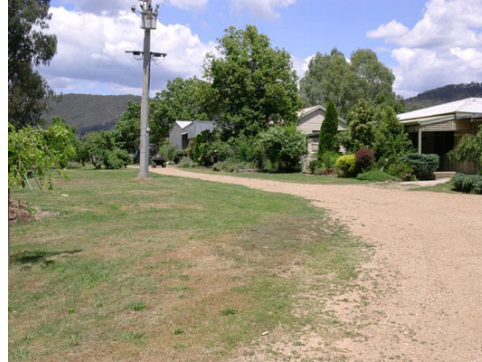
Picture 1. Entry

Aspens Springs provides farm stay accommodation. An array of farm activities is offered, including feeding of farm animals, pony rides, and fishing. There are also facilities for special interest groups such as artists, photographers, gardeners, paragliders, horse riders, bushwalkers and birdwatchers. The owners are very willing to help anyone with access needs. There are 3 cottages in total, with one being set up with adequate accessibility - Peacock Barn. Peacock Barn can sleep up to ten people. Another cottage has an accessible bathroom, which can be accessed through a carport. All cottages are fully self-contained.