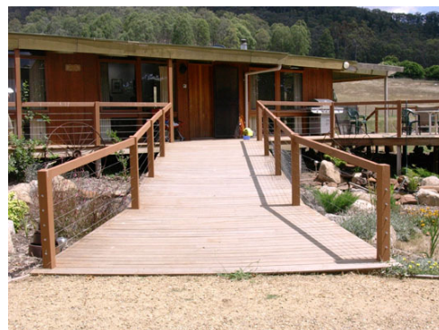
Picture 2. Reception entry

The door into reception is light, inward opening, and is 760mm wide. The handle is a knob, 900mm high. There is plenty of circulation space once in the reception area, over floorboards. Lighting is good and a doormat is the only potential hazard. There is no counter to negotiate.