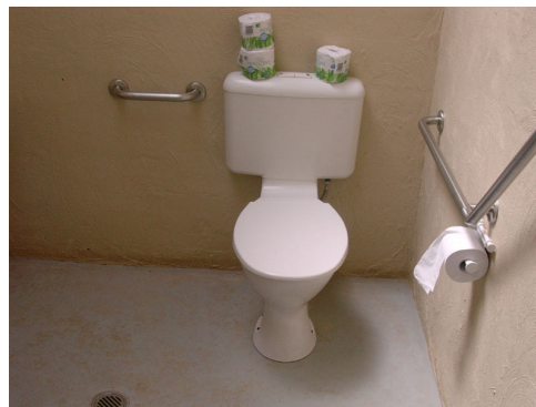
Picture 4. Accessible toilet