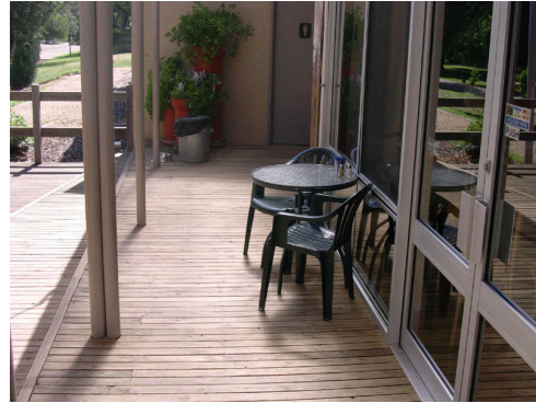
Picture 3. Path of travel to accessible toilet

There is an accessible toilet adjacent to Riverdeck Cafe. The key is with the Cafe staff. The door to the outside area is 800mm wide, is inward opening, and self closes. It had a D handle, 800mm-1030mm in height. It is of medium weight. The path to the toilet is along the deck, which is 1830mm wide. The bathroom is unisex. The door into the bathroom is 780mm wide. It is outward opening, of medium weight, and does not self-close. The outside handle is a D handle, approximately 1000mm high. There is good circulation space in the bathroom area, and the floor surface is concrete.