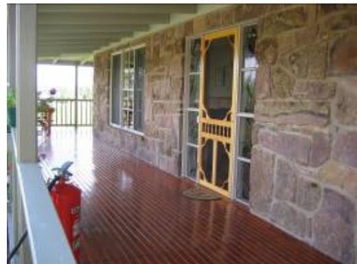
Picture 3. Entrance

The carport at the cottage is concrete, although a little narrow at 3m wide. There are plans to widen this area. At present vehicle exit on one side is onto a slightly uneven gravel surface while the other exits onto concrete adjacent to the ramp.