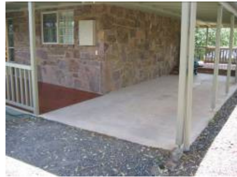
Picture 2. Parking

Parking is available at either reception or next to the cottage, however reception is not accessible. Reception is at the owners' house. There is a gravel parking area with a path (including two platform steps) to the front door of reception.