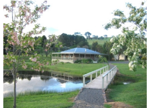
Picture 1. Buttercup Cottage

Buttercup Cottage is a self contained unit that sleeps 4, with 1 double and 2 single beds, located in a rural setting. The unit is quite spacious with good clearances and circulation space. Accessibility has been well provided for throughout the building with the bathroom, shower and toilet facilities in particular provide very good accessibility.