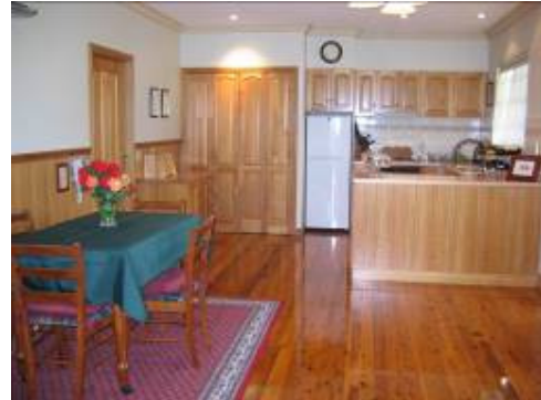
Picture 4. Kitchen/Dining

The sink tap is 485mm back from the front of the bench and 100mm higher than the bench.