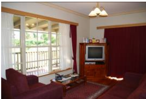
Picture 5. Lounge Area